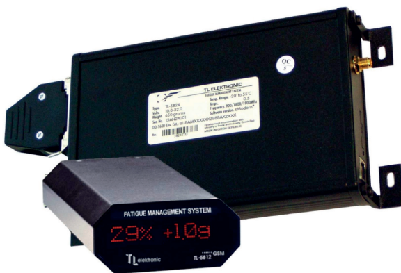
Fig. 1. TL Electronic TL-5824 Fatigue-meter unit

The United States Federal Aviation Authority (FAA) has taken several initiatives on GA aircraft structural fatigue monitoring and management, through collaborative research and development programs between the industry and academia (e.g. Embry-Riddle, University of Texas at San Antonio), mainly focused on the collection of real-life usage data from GA aircraft fleets with the use of on-board sensors and data recording systems (FAA 1994; FAA 2001a; FAA 2001b; FAA 2001c; FAA 2006). These projects, some of them still in progress or under evolution, have led to the development of methods and equipment capable of acquiring, collecting and analysing flight load data (e.g. the Airframe Cumulative Fatigue Monitoring System – FAA 1994), as well as calculating the structural fatigue in GA aircraft structures (wing, fuselage, empennage, landing gear) through a probabilistic safe life approach (Ocampo, Millwater 2010; Ocampo et al. 2011; Kulyk et al. 2011). Also, some other low-cost technological devices (fatigue monitoring systems) have been developed in an effort to capture the GA aircraft market (e.g. the TL Electronic TL-4324 Fatiguemeter and the TL-5824 Structural Life Monitoring Unit (Marci et al. 2004), which is depicted in figure 1).