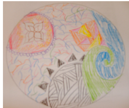
Figure 2. Free-coloured unstructured mandala (student coloured on a blank circle)