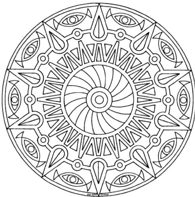
Figure 1. Pre-drawn structured mandala design

The Math Anxiety Rating Scale-Revised (MARS-R) developed by Hopko (2003) was used to measure students' math anxiety in business statistics courses. This 12-item scale has been revised and validated amongst other anxiety-related instruments such as the Learning Math Anxiety (LMA) and Math Evaluation Anxiety (MEA) Scales (Hopko, 2003). Sample items include, "having to use the tables in the back of a math book," "being told how to interpret probability statements," and "reading and interpreting graphs or charts." Participants assess