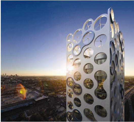
Fig. 1. COR Tower designed for Miami (courtesy of Oppenheim Architect + Design)

more open and entertainment spaces; 4) envelop opacity without extensive solar gain and glare and with insulation from external temperature variations; 5) vegetation: Vegetation improves both structural and urban scales. An example of this approach is the COR Tower (Fig. 1) designed by “Oppenheim Architect + Design” in 2007. This building which is equipped with wind turbines in its facades strives to achieve a balance between transparency and opacity in its skin.